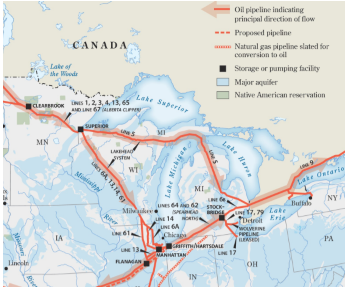
Enbridge Great Lakes System Configuration